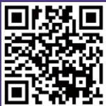
[College of International Education Official Website]