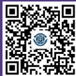
[WeChat Official Account] StudyatHIT